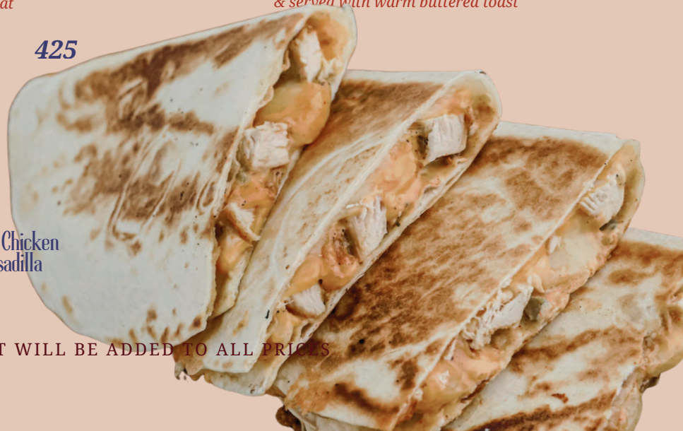
Grilled Chicken Quesadilla

Zesty lemon-coriander broth—light, aromatic, & served with warm buttered toast