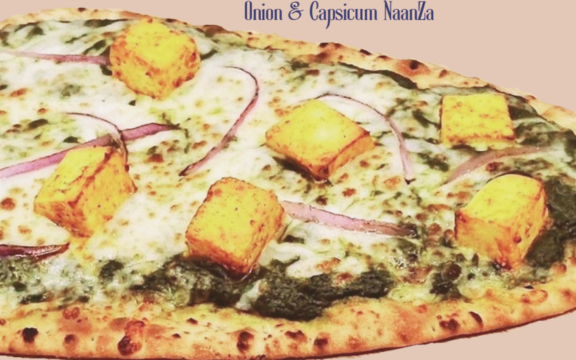
Paneer Tikka, Onion & Capsicum NaanZa