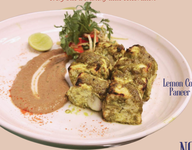
Lemon Coriander Paneer Tikka