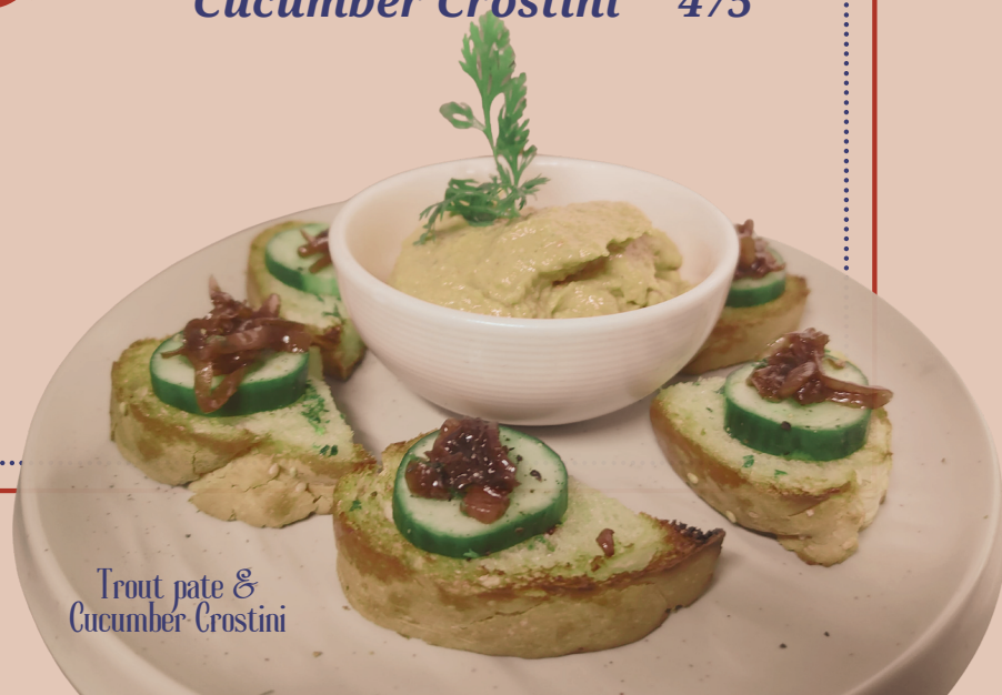
Trout pate & Cucumber Crostini