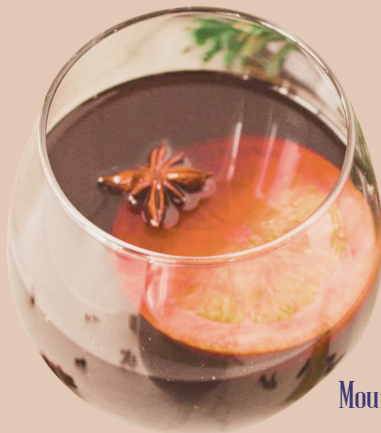
Mountain Mulled wine

Red wine, Brandy, Honey, Orange, Apple, Cinnamon & Local Spices