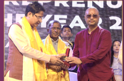
Governor of Sikkim / MP Darjeeling Shree L.P. Acharya / Shree Raju Bista