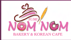
Nom Nom Bakery & Korean Cafe