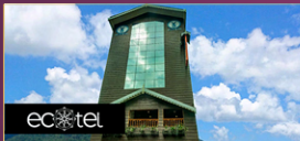
Property Name: Ecotel Tin Tin, Darjeeling Property Category: Ecotel (Economy) Number of Rooms: 12 (Twelve)