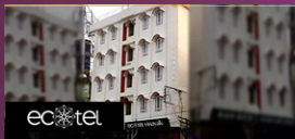
Property Name: Ecotel Vinayak, Siliguri Property Category: Ecotel (Economy) Number of Rooms: 48 (Forty Eight) Extra Amenities: Banquet Hall, Parking Space