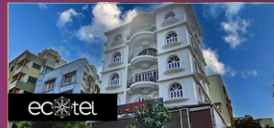
Property Name: Ecotel Kolkata, West Bengal Property Category: Ecotel (Economy) Number of Rooms: 10 (ten)