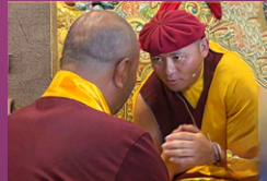
Dali Monastery Darjeeling Rimpoche