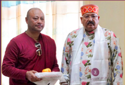
Spiritual Guru Shree Satpal Maharaj