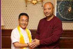
Chief Minister of Sikkim Shree Prem Singh Tamang