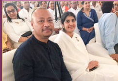
Spiritual Mentor (Brahma Kumaris) Sister Shivani