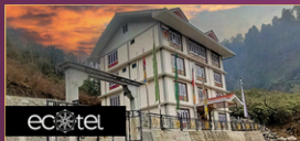
Property Name: Ecotel Sonam Lachung, Sikkim Property Category: Ecotel (Economy) Number of Rooms: 14 (Fourteen)