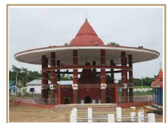
FOURTEEN GODDESS TEMPLE

It is a two storied mansion, having a mixed type of architecture with three high domes, the central one being 86' high.