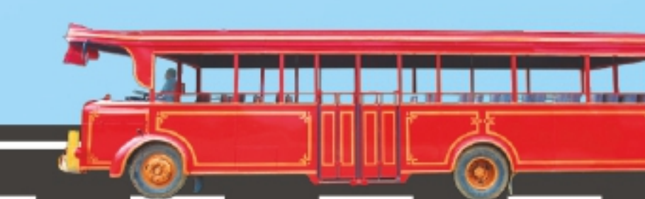
RAMOJI ADVENTURE AT SAHAS