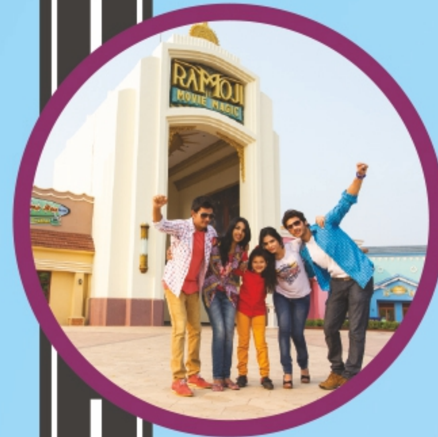
RAMOJI MOVIE MAGIC