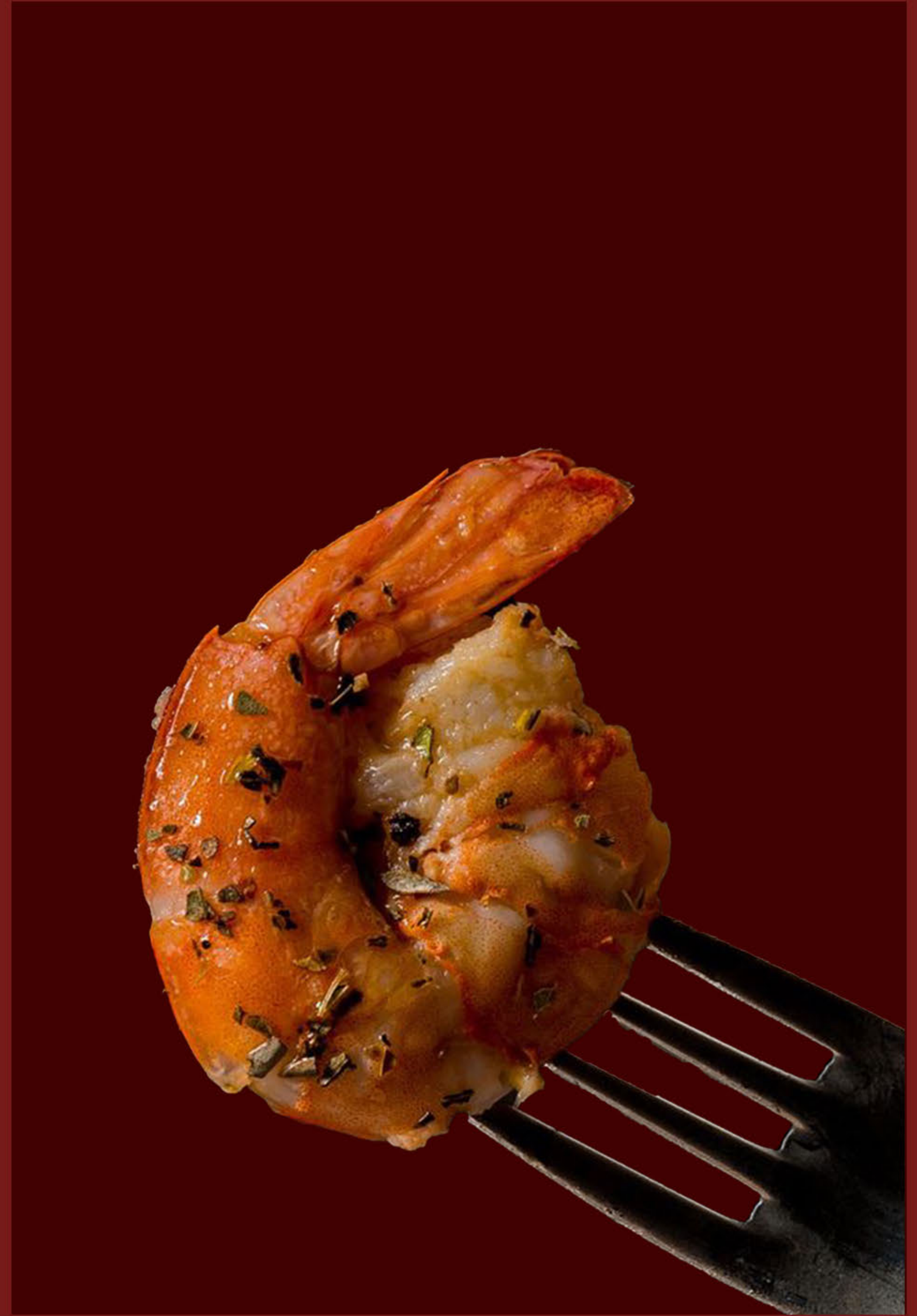
Spicy Garlic Shrimp