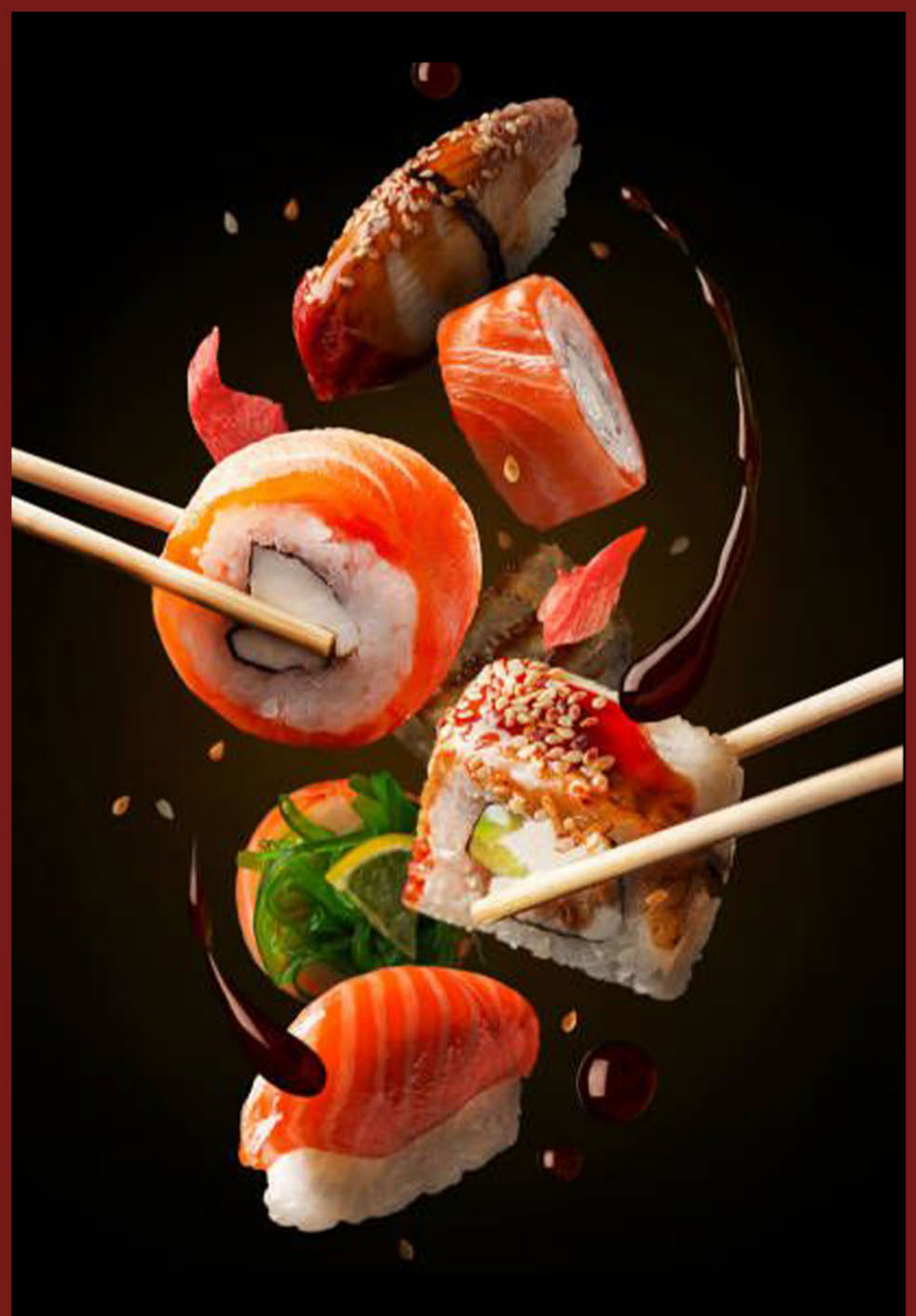
Signature Enoki Sushi Roll