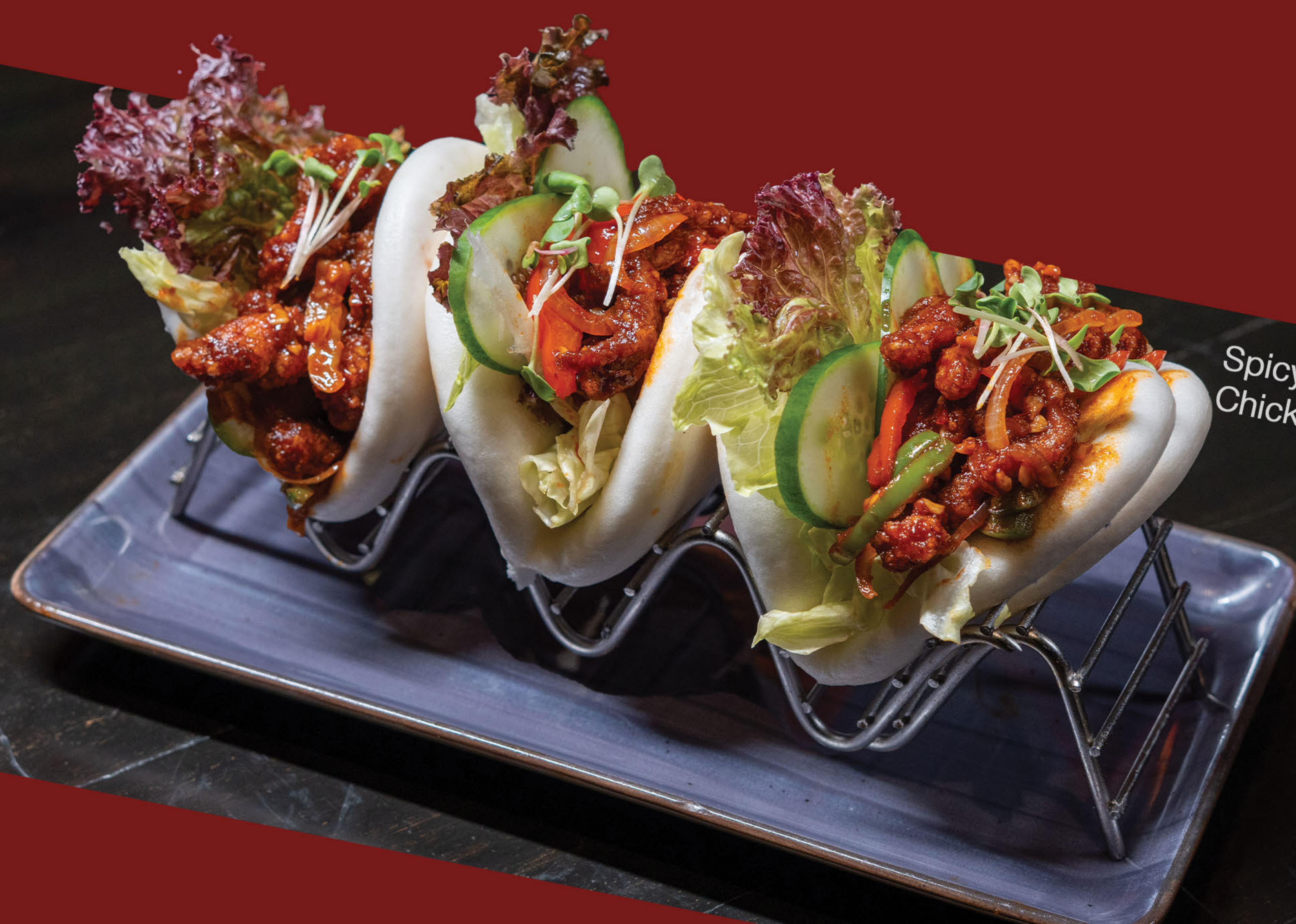
Spicy Korean Chicken Bao