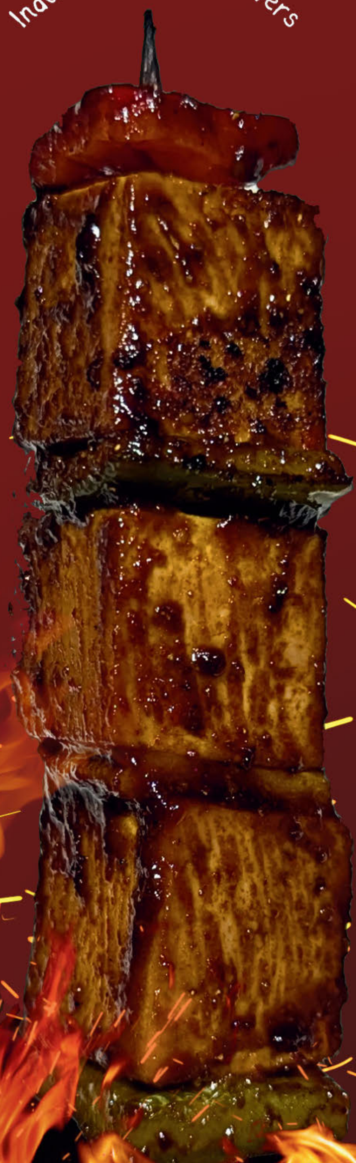
Malaysian Chicken Satay