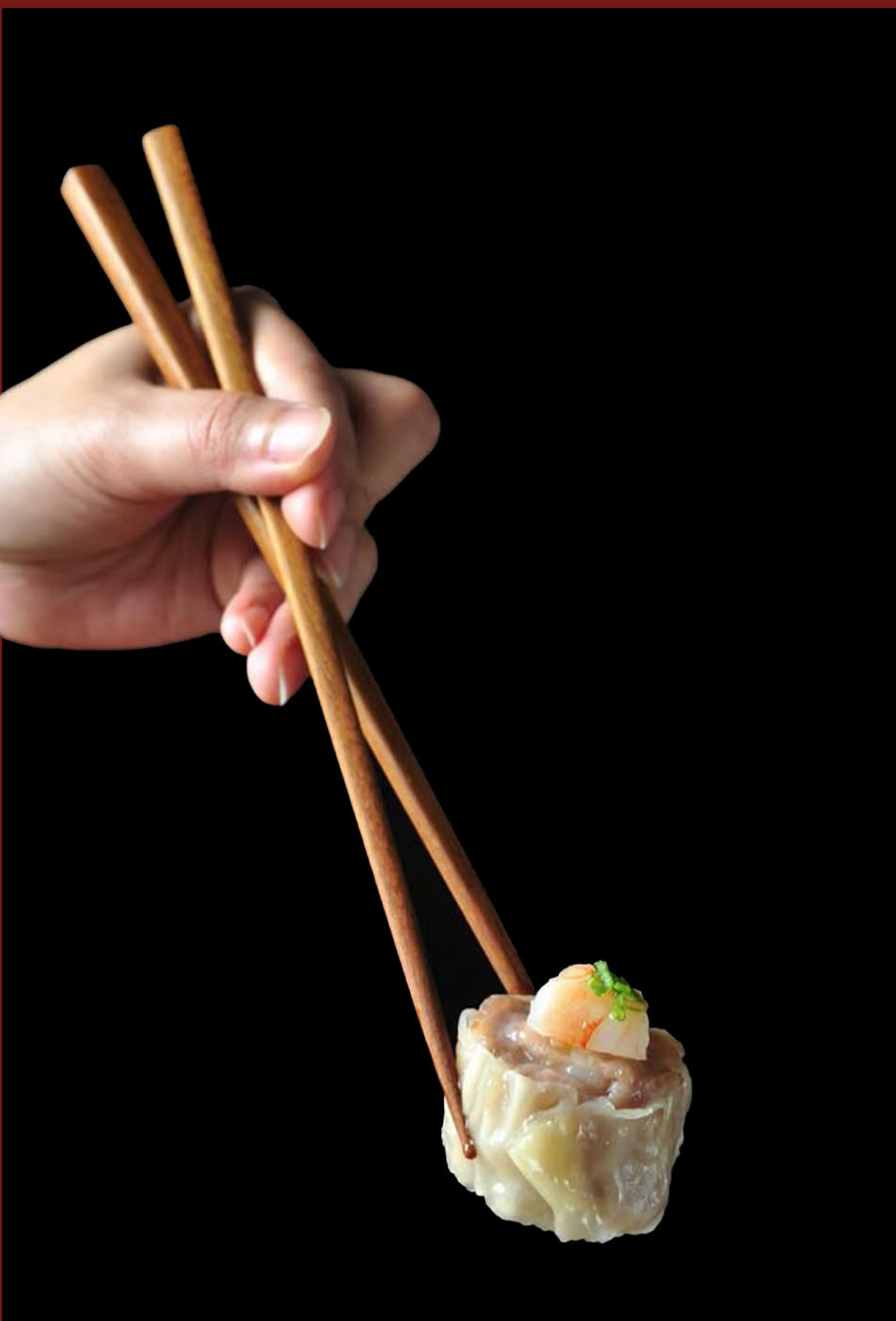
Shrimp Dim Sum