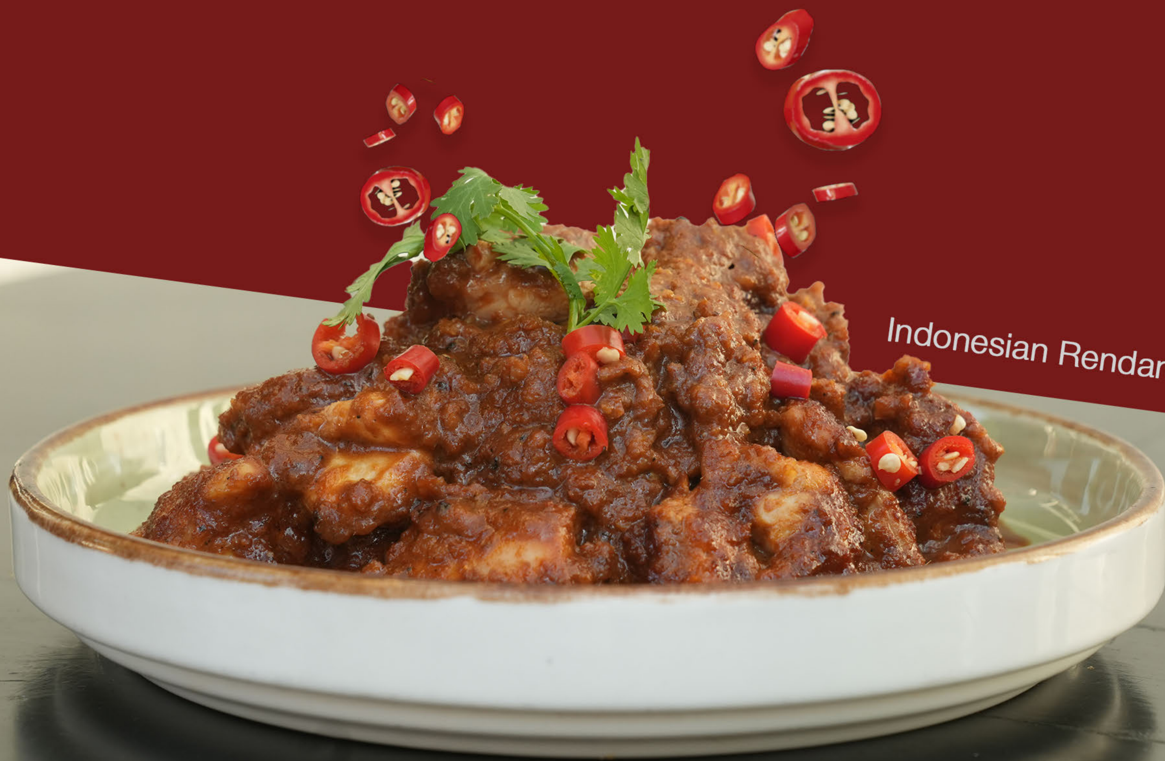
Indonesian Rendang chicken