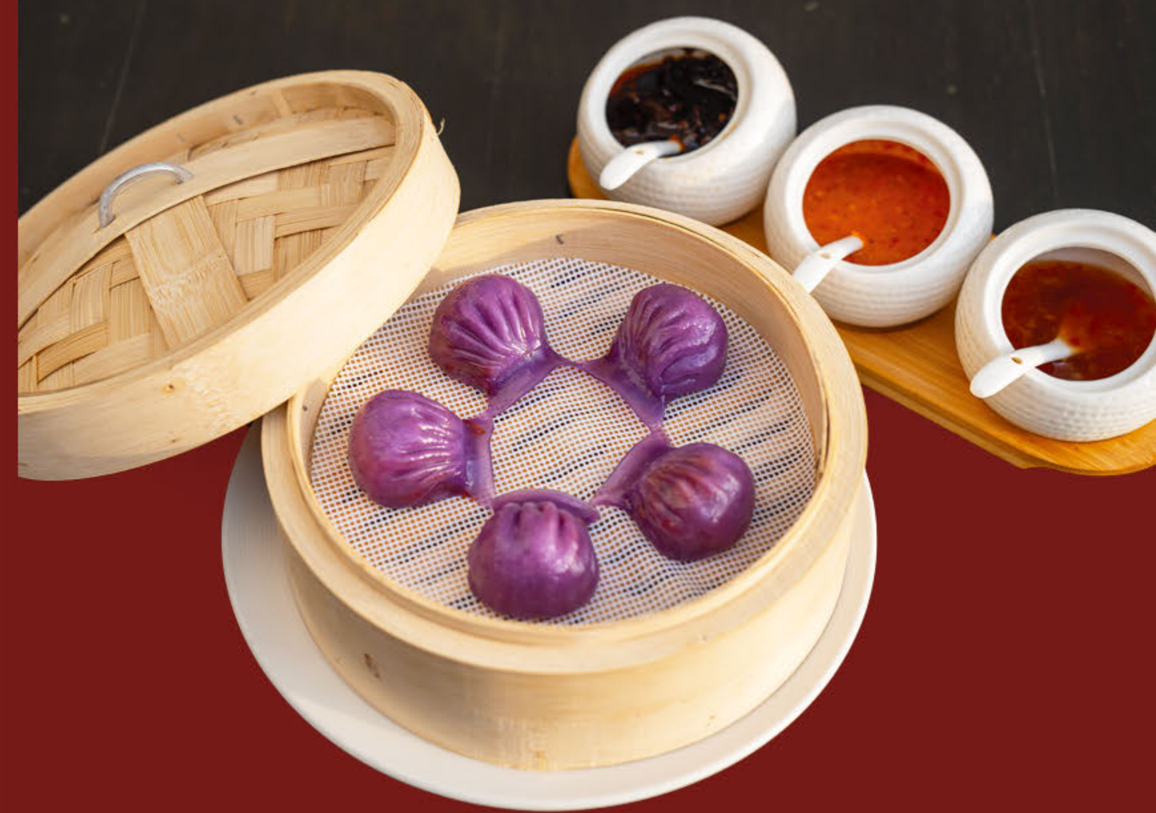
Chicken And Chilli Basil Dimsum

Traditional Cantonese dumplings with seasoned prawns, and sesame oil